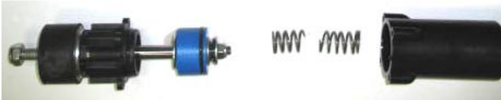
Figure 1 - Stroke Limiter Shock Assembly

The purpose of these instructions is to provide a procedure for replacing a broken internal spring in the GS-X Pinsetter Stroke Limiter Shock. Figure 1 shows a shock with a broken spring.