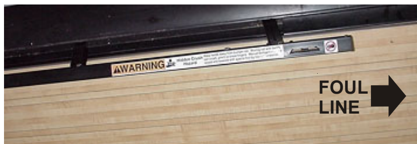
LABEL ON RIGHT SIDE OF LANE - ADHERE TO RAIL