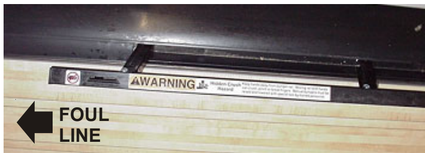
LABEL ON LEFT SIDE OF LANE - ADHERE TO RAIL

To help reinforce the risk of handling the bumpers, we are providing warning labels to be affixed to the bumper rails. The labels should be affixed at the foul line end of each bumper rail, with the text oriented so it can be easily read by the bowler, ensuring that any customer or employee will be warned of this hazard. Refer to Figure 1.