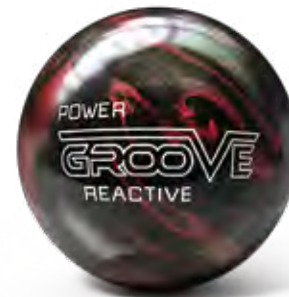
NEW Black/Pink Pearl 60-105215