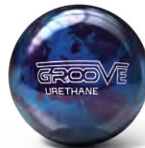
GROOVE ® URETHANE Dark Blue/Light Blue Polished 60-104775