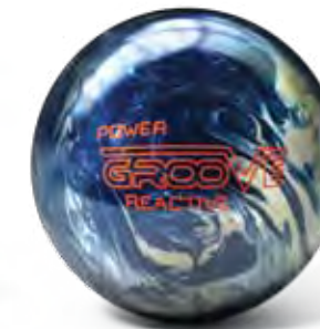
Blue Pearl/Ivory 60-104598