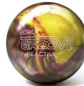
NEW Merlot/Gold Pearl 60-105216