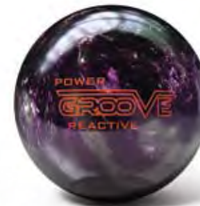
Purple/Silver Pearl 60-104074