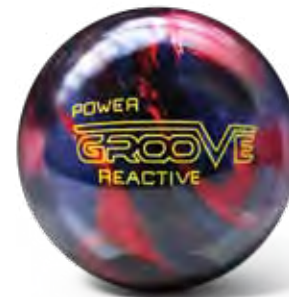
Blue Pearl/Red Pearl 60-104597