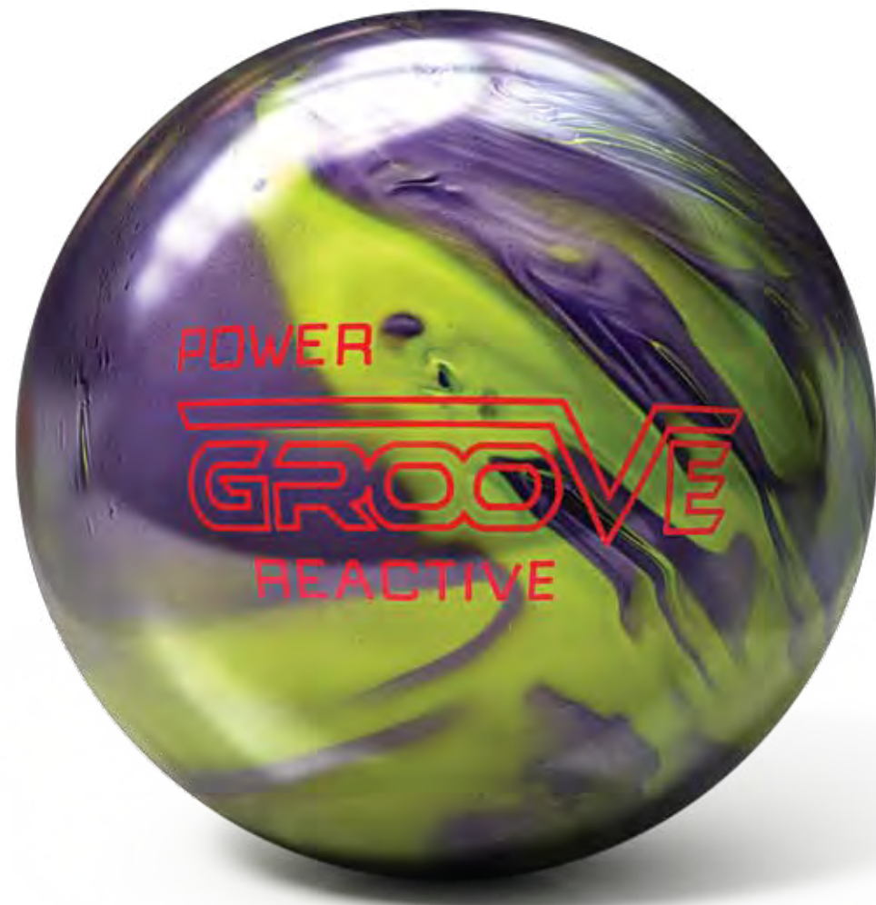
NEW — Lime/Lavender Pearl 60-105220

Reactive coverstocks respond more aggressively to dry lane surfaces, increasing backend hooking action and hitting power. All Power Groove reactive balls feature PowrKoil 17 ™ , the strongest reactive coverstock ever used on a Groove-class ball, and Brunswick DISC ™ (Differential Increasing Side Cylinders) core technology.