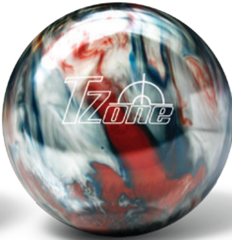
PATRIOT BLAZE 60-105300-93X - Weights 6, 8-16