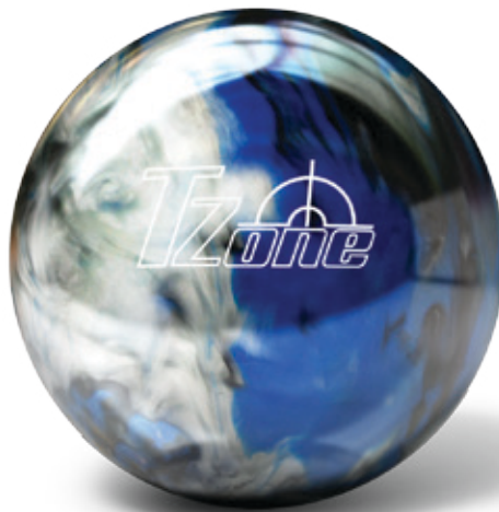
INDIGO SWIRL 60-105302-93X - Weights 6, 8-16