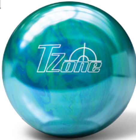
CARIBBEAN BLUE 60-105354-93X - Weights 6, 8-16