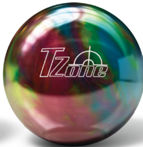
RAINBOW TWIST 60-105448-93X – Weights 6, 8-16