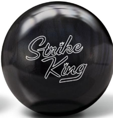
BLACK PEARL 60-105536-93X