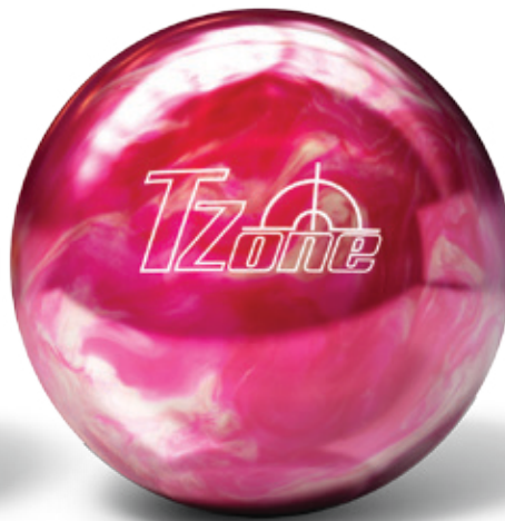
PINK BLISS 60-105299-93X - Weights 6, 8-14