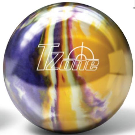
GROOVY GRAPE 60-105449-93X – Weights 6, 8-16