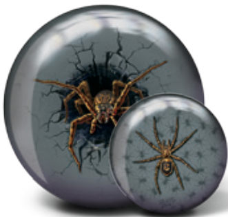
SPIDER – NEW 60-400596-93X