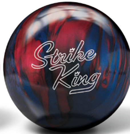
BLUE/RED PEARL 60-105540-93X