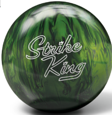
EMERALD PEARL - NEW 60-105632-93X