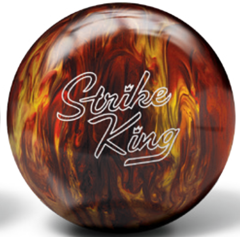
RED/GOLD PEARL 60-105538-93X