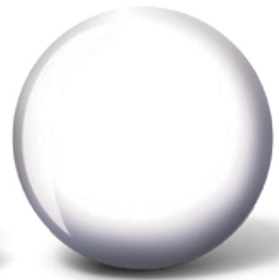
WHITE BALL 60-104221-93X