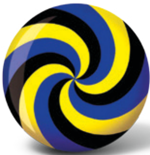
SPIRAL YELLOW/BLUE/BLACK 60-400575-93X