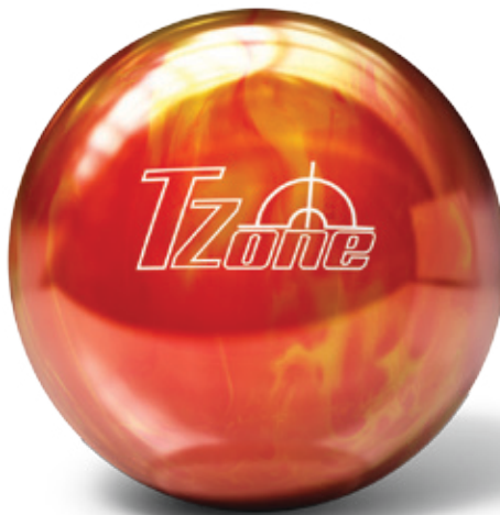
HOT LAVA 60-105447-93X – Weights 6, 8-16