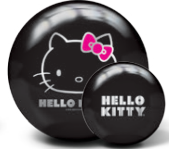
HELLO KITTY® BLACK 60-400590-93X - U.S., Canada & Mexico