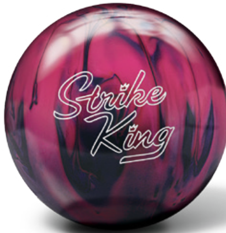
PURPLE/PINK PEARL 60-105539-93X