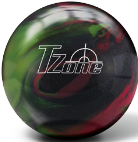
NORTHERN LIGHTS 60-105526-93X – Weights 6, 8-16