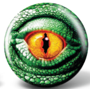
LIZARD EYE 60-400528-93X