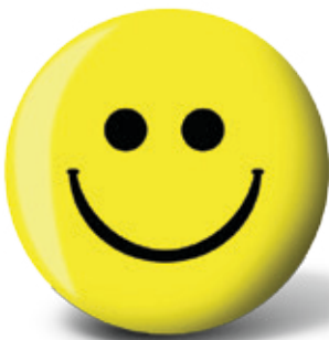
SMILEY FACE 60-400245-93X