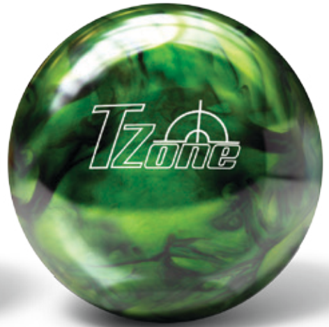
GREEN ENVY 60-105298-93X - Weights 6, 8-16