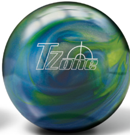
BLUE LAGOON 60-105527-93X – Weights 6, 8-16