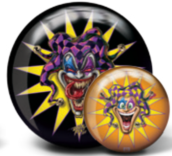
JOKER – NEW 60-400595-93X